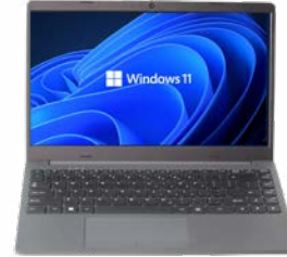
Crius N310-G1 Notebook available in 14"

Ciara's commitment to vPro Enterprise ensures top-notch security and manageability, making this laptop a compelling choice for both professionals and tech enthusiasts alike.